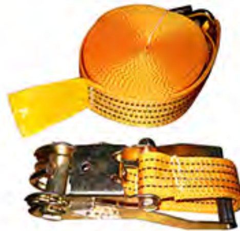
EA 28001 Ratchet Tie Down