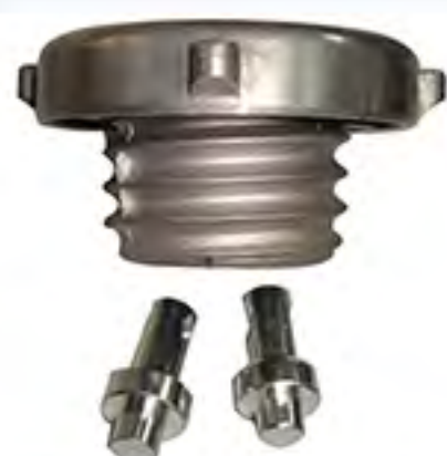
EA 14009 Fuel Tank Cover • 2108, Metal-3