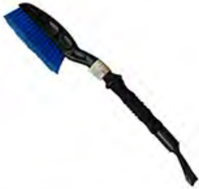
EA 18014 Snow Brush