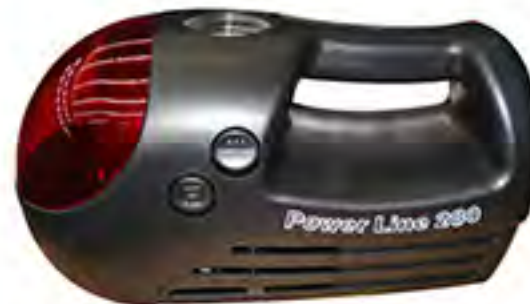
AC 3357 Air Compressor 250 PSI 3-IN-1