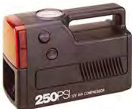
AC 3327 Air Compressor 250 PSI 3-IN-1