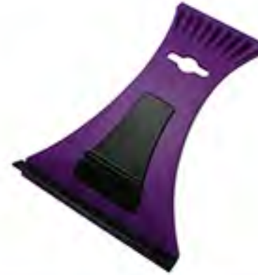
EA 17002 Ice Scraper