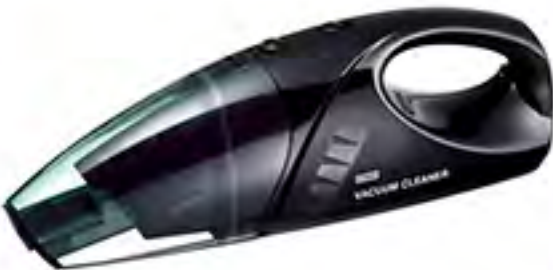
VC 6132 Vaccum Cleaner