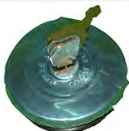
EA 14015 Fuel Tank Cover • Renault Type