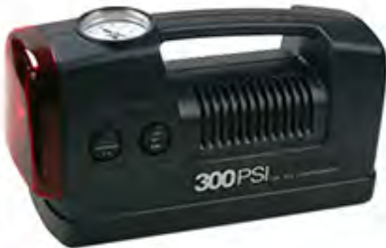
AC 3301 Air Compressor 300 PSI 3-IN-1