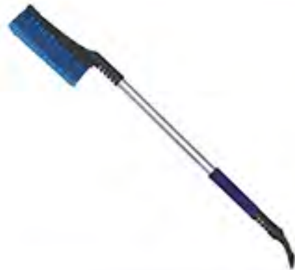
EA 18018 Snow Brush