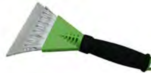
EA 17004 Ice Scraper