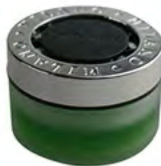
IA 1012 - A

Gel Type : Sweet Lemon, Lemon, Osmanthus, Sea