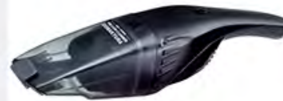
VC 6131 Vaccum Cleaner