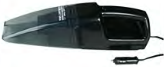
VC 6025 Vaccum Cleaner