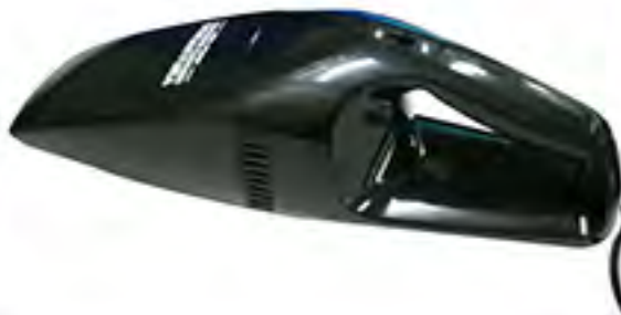
VC 6038 Vaccum Cleaner