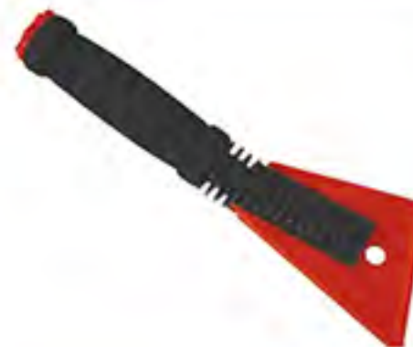
EA 17008 Ice Scraper