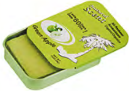
IA 1010 -A