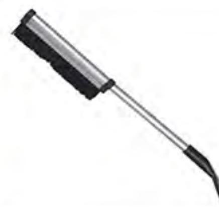
EA 18021 Snow Brush