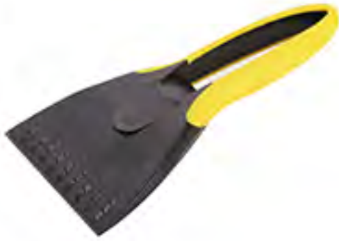
EA 17003 Ice Scraper