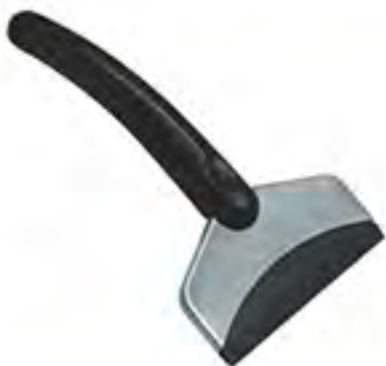
EA 17007 Ice Scraper