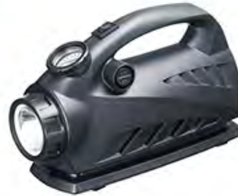
AC 3302 Air Compressor 250 PSI with Light