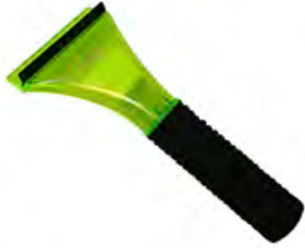
EA 17001 Ice Scraper