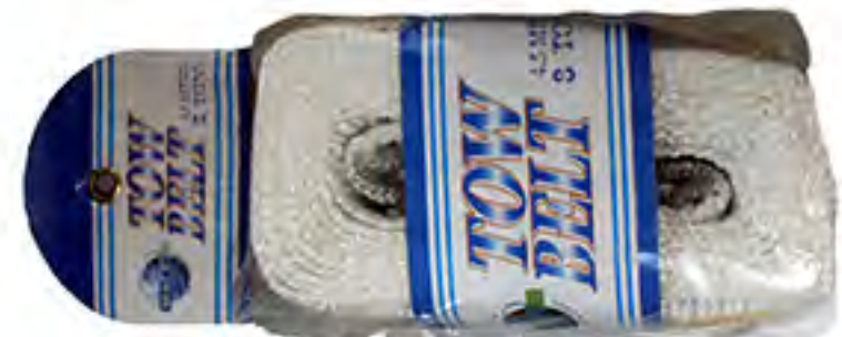
Polybag with header card