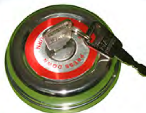
EA 14016 Fuel Tank Cover • Opel Audi Type • Ford :1.6 2.0 2.8 • BMW :315,316,318,320,520 • Benz:200,230,280,300,450