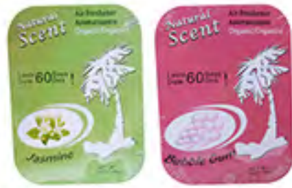
IA 1010 -B

Square Organic Air Freshener, Scent: Bubble gum, Lemon, Blace Ice, Vanilla, Jasmine, New Car, Strawberry, Cherry, Cocunut, Green Apple