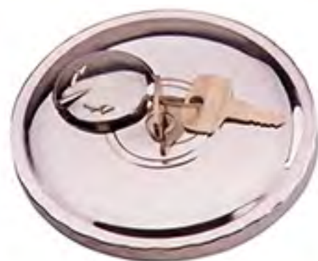
EA 14017 Fuel Tank Cover • Benz (Trucks) Type