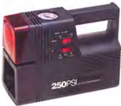
AC 3325 Air Compressor 250 PSI 3-IN-1