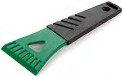
EA 17005 Ice Scraper