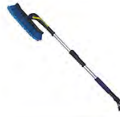
EA 18019 Snow Brush