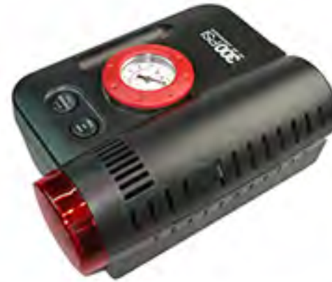
AC 2155 Air Compressor 300 PSI 3-IN-1