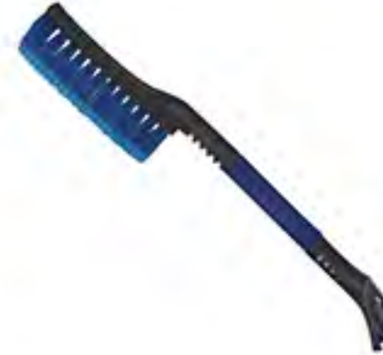
EA 18017 Snow Brush