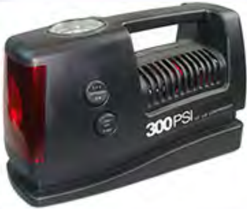
AC 2153 Air Compressor 300 PSI 3-IN-1