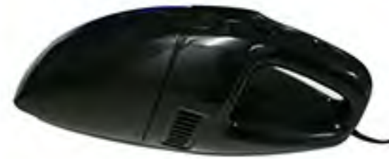
VC 6028 Vaccum Cleaner