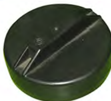
EA 14010 Fuel Tank Cover • Toyota : Land Cruiser • Crown, Corona Type