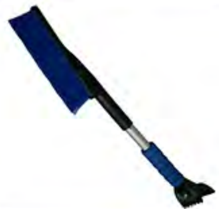
EA 18020 Snow Brush