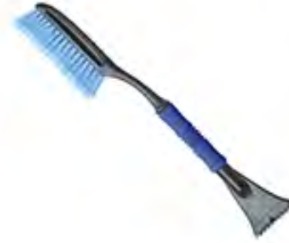
EA 18015 Snow Brush