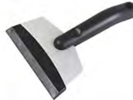
EA 17006 Ice Scraper