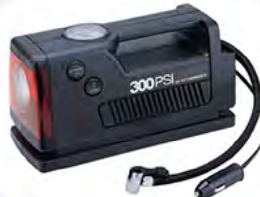
AC 3326 Air Compressor 250 PSI 3-IN-1