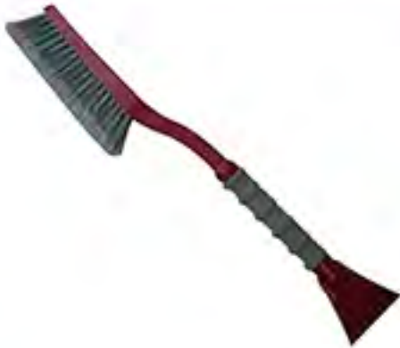
EA 18016 Snow Brush